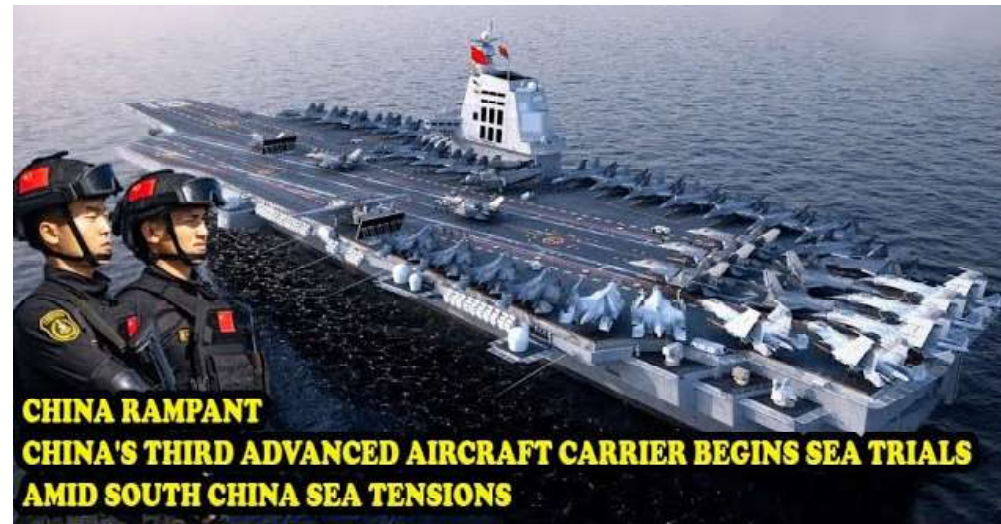
CHINA RAMPANT CHINA'S THIRD ADVANCED AIRCRAFT CARRIER BEGINS SEA TRIALS AMID SOUTH CHINA SEA TENSIONS