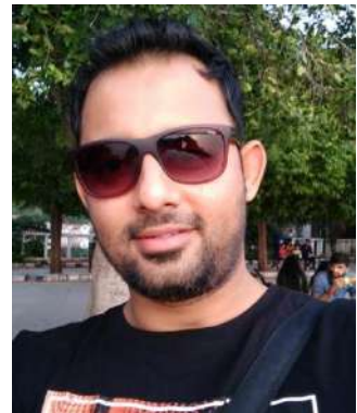
With Googles X