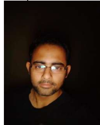
with Spectacles X